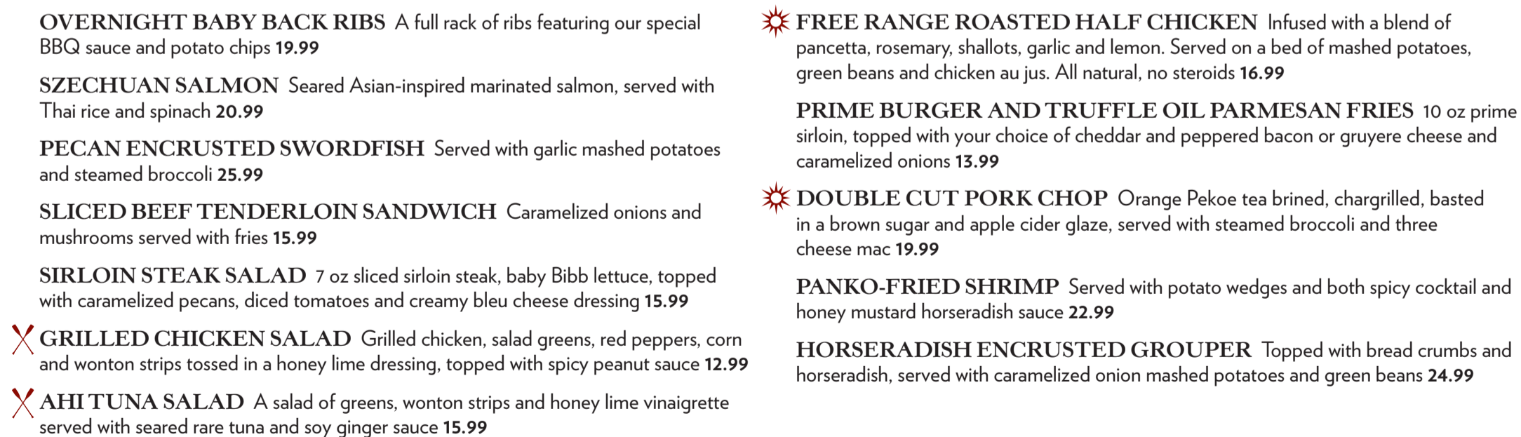
TABLE SIDE DISHES